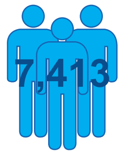
Workers receiving senior level pay.